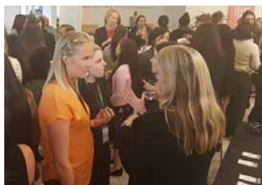
2019 Women in Logistics Forum – networking