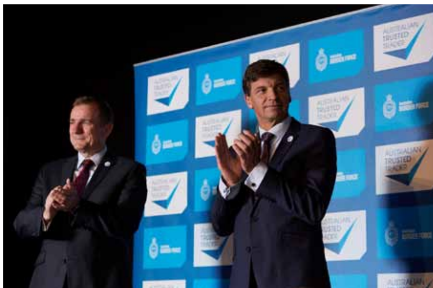
ABF Commissioner Michael Outram and Minister for Law Enforcement and Cyber Security Angus Taylor