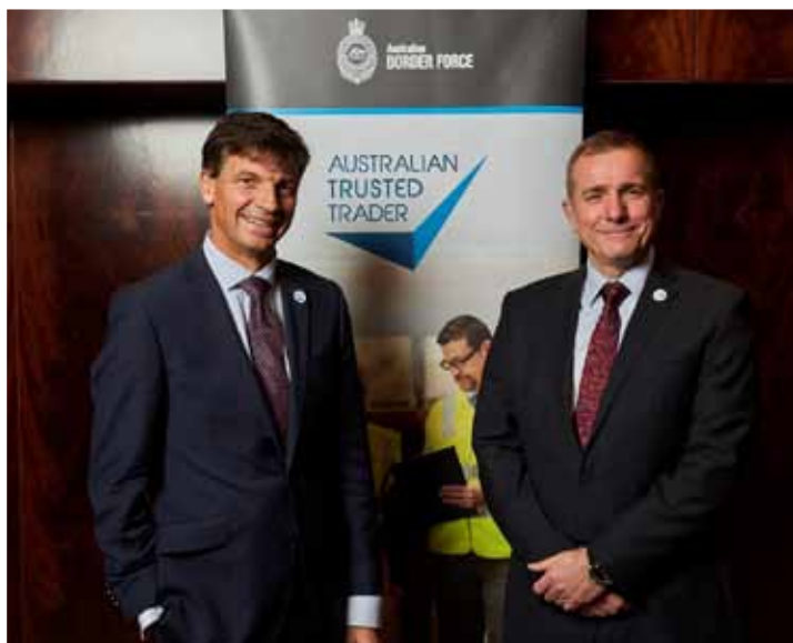
Minister for Law Enforcement and Cyber Security Angus Taylor and ABF Commissioner Michael Outram