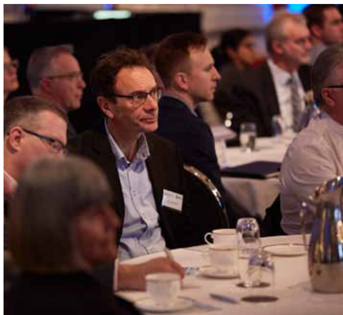
Trusted Traders enjoy a seat at the table at the Symposium