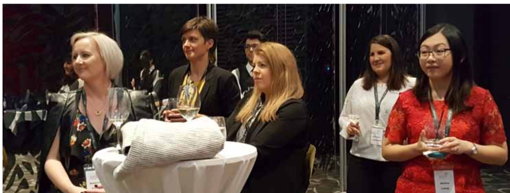
2018 WISTA Australia Conference – Opening Cocktail & Networking Function