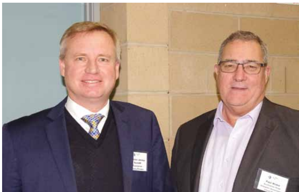
Hon. Jeremy Rockcliff (Deputy Premier Tasmania, Minister for Education and Training, Minister for Infrastructure, Minister for Advanced Manufacturing and Defence Industries) and Paul Blake (Chairman APSA) at the 2018 Tasmanian Freight & Logistics Forum

Regrettably, as it turns out, the legislation as it was interpreted at that time upheld the lines' position on confidentiality of the stevedoring agreements and the THC became a reality.