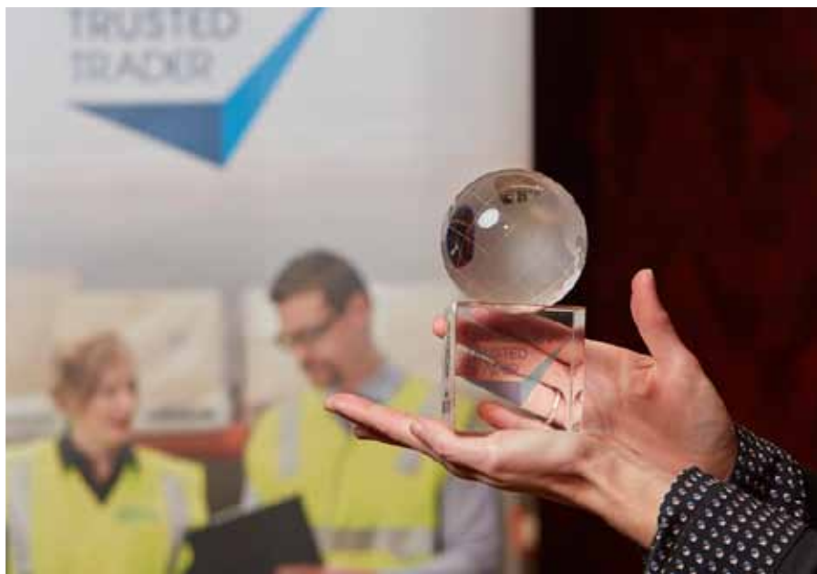
Australian Trusted Trader accreditation globe