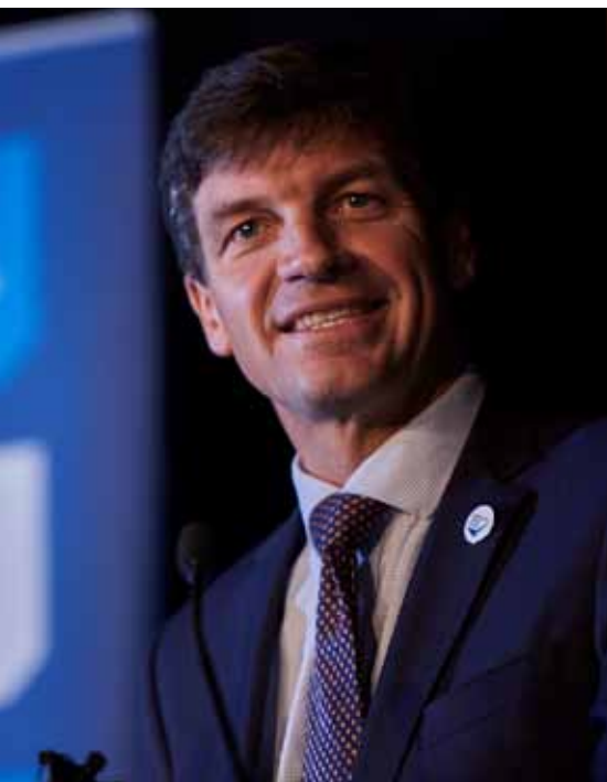
By HON ANGUS TAYLOR MP, the Minister for Law Enforcement and Cybersecurity

AUSTRALIA'S prosperity is dependent on our nation being open, engaged and connected to the rest of the world.